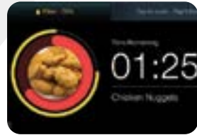
Red ring indicates cook time progress; gold ring indicates remaining oil life to filter