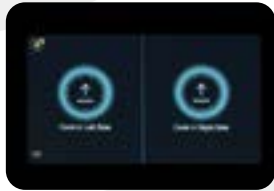
Cook in left or right side