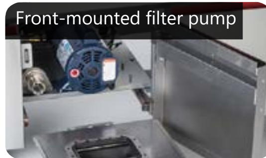
Front-mounted filter pump