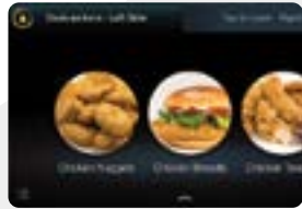
Pick food item